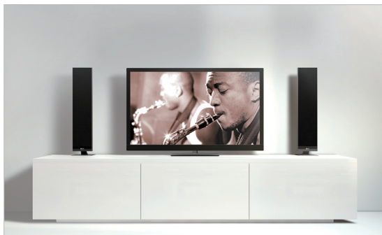
Activation Module - TV Mount

KEF reserves the right, in line with continuing research and development, to amend or change specifications. E&OE.